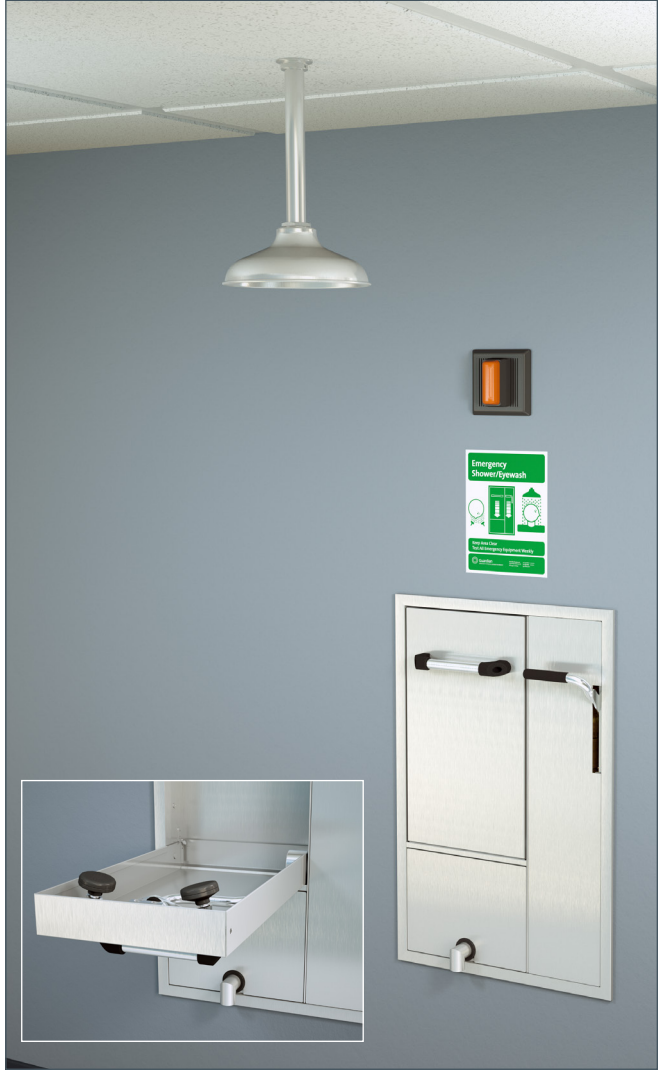
Note: Shown with optional AP280-235 electric light and alarm horn unit (sold separately).