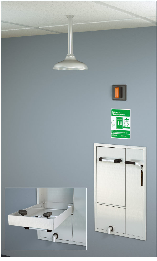
Note: Shown with optional AP280-235 electric light and alarm horn unit (sold separately).