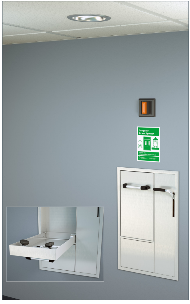
Note: Shown with optional AP280-235 electric light and alarm horn unit (sold separately).